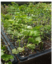
And here is where it all starts. Just one of the more than 2000 cuttings in Robin's Nursery.

If you ever have the chance, a visit to Robin's nursery is an absolute delight!