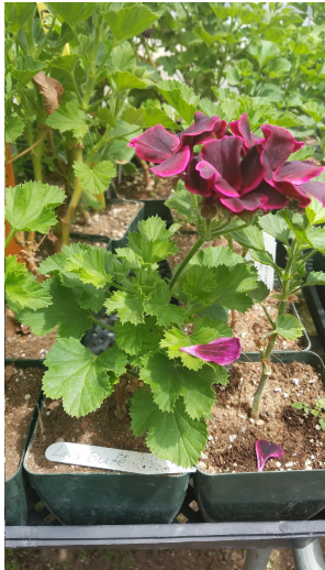
Lord Bute This has a really nice light edge on the petals. Robin had a collection of similar plants with different color combinations