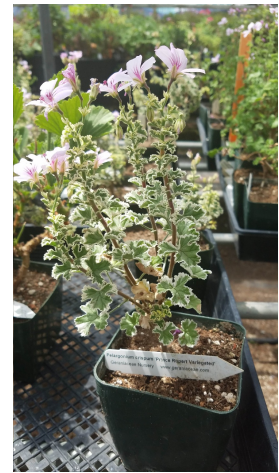
Prince Rupert caught our eye with its white fringe on its leaves.