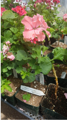
Georgia Peach has the most amazing peach color.