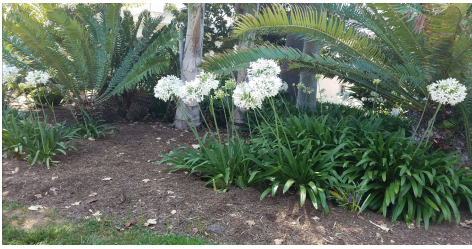
This Agapanthus is at the Huntington Library and is the largest and most impressive Agapanthus (AKA Lily of the Nile) I have ever seen.