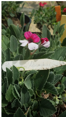
The name Splendide says it all!