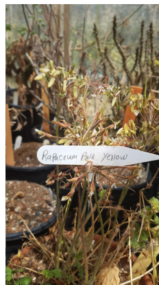
P. Rapaceum This is one of Robins rare pelargoniums. It has an underground tuber and can resprout after a fire.