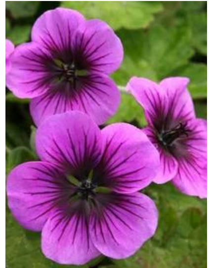
G. Perfect Storm