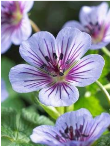
G. Crystal Lake