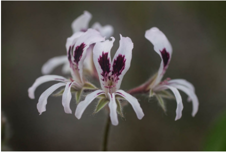
Pelargonium longifolium (Geraniaceae)

One of the most confusing generic names to any gardener is Geranium. Anyone familiar with temporary planting schemes will know the popular Bedding Geraniums. This is the rather misleading common name for hybrids of the genus Pelargonium (mainly derived from Pelargonium zonale ). To distinguish them, true Geranium are often called Hardy Geraniums. Most species and hybrids of true Geraniums are able to tolerate several degrees of frost, and therefore can live outside all year round, even in cold climates. So you cannot talk just about a geranium, you have to clarify whether you mean a Bedding Geranium or a Hardy Geranium, ie. Pelargonium or Geranium respectively.