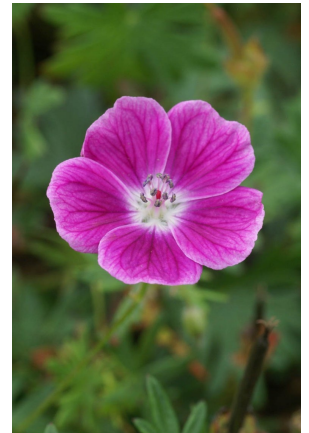
Geranium sanguineum 'Elke' (Geraniaceae)

Fortunately, the two genera are quite easy to tell apart. Geraniums have flowers with 5 more or less identical petals, usually arranged in a flat or bowl shaped. Pelargoniums also have 5 petals but they are arranged 2 above and 3 below. The 2 upper petals are usually larger and broader than the lower 3 (indeed in some species the lower 3 are even missing). So Geranium flowers have radially symmetric flowers (actinomorphic), whereas Pelargonium flowers have a single plane of symmetry (zygomorphic).