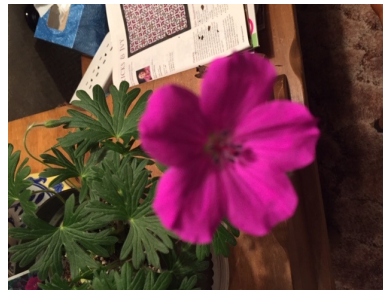
G. Tiny Monster