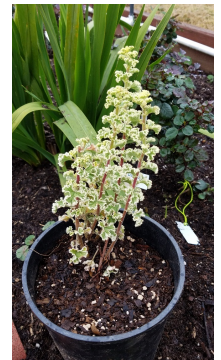
P. crispum variegated