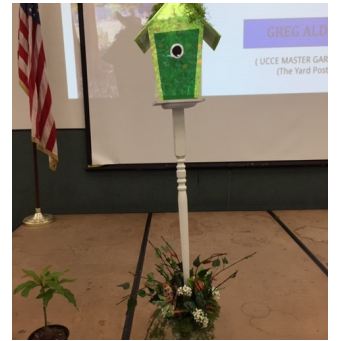
Joyce brought in this birdhouse from the Geranium Conference