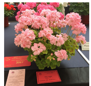
Gold leaf zonal - "Bembridge"