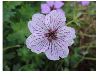
Cinereum seedling by Cyril Foster