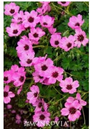
G. cinereum 'Ballerina'